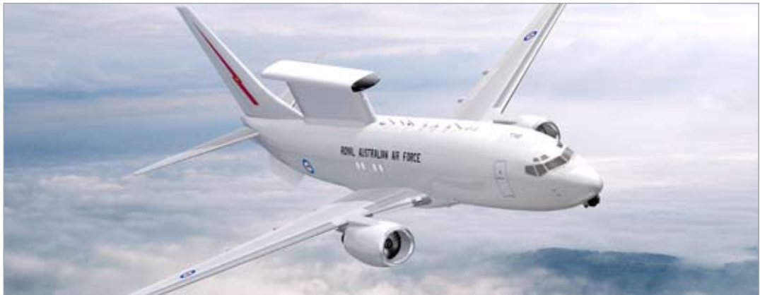
400 Hz application for aircraft