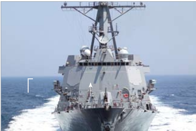
60 Hz application for Navy